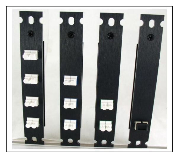
As is the case with all of our MPS panels, they can be supplied engraved with text unique for your application.

connectors are recessed so that only 1/8", of the actual connectors, protrude through the front of the panel. This provides protection for the termination and a more attractive finish. The picture below shows the (4) panels with connectors.