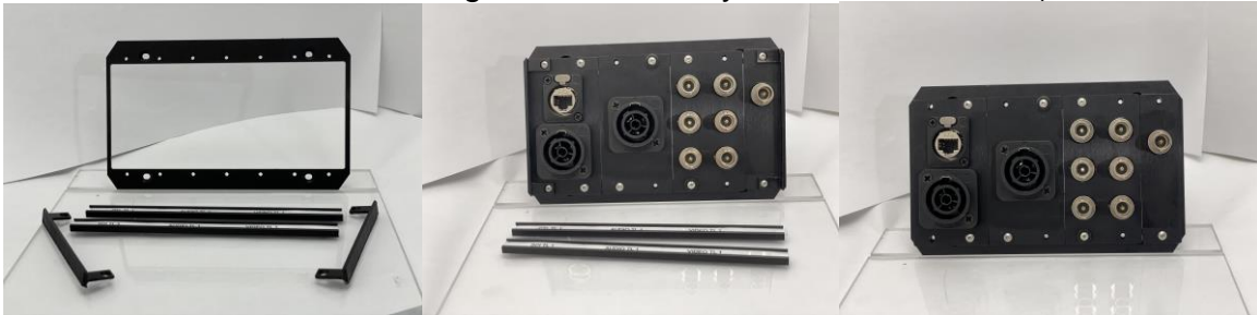
Example: Complete L-MPS-8AT Adapter Plate, 3-Gang

Shown here is different stages of assembly of the 8AT AP (L-MPS-3G-8AT-AP).